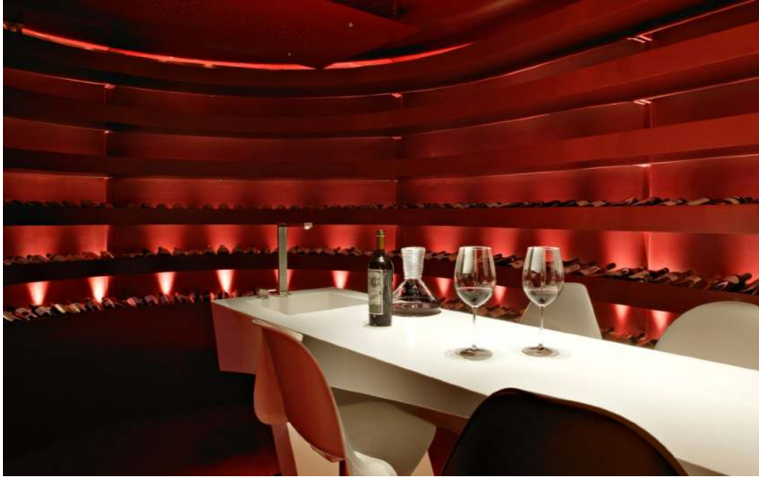
Teatro del Vino. Hotel Grau Roig