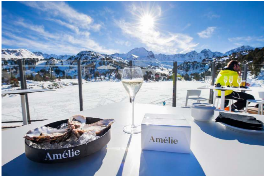
Terraza Restaurante Pesssons en Grandvalira