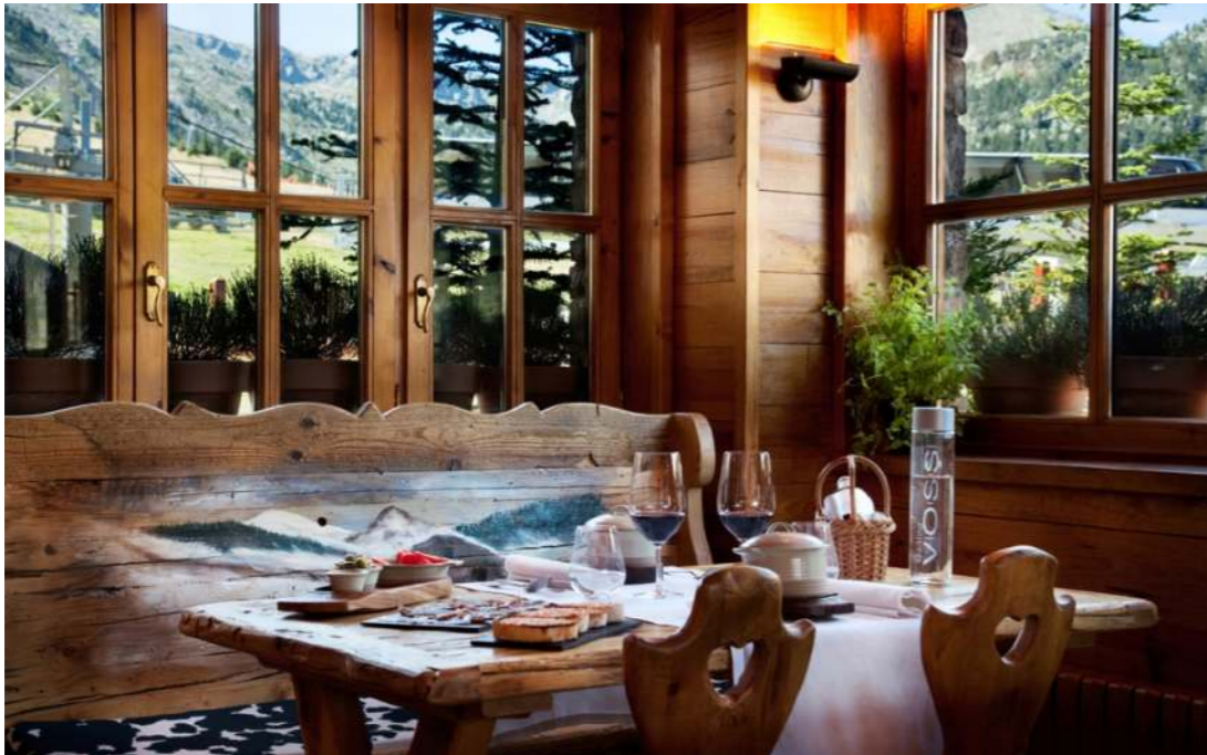
Restaurante Vaquería. Hotel Grau Roig