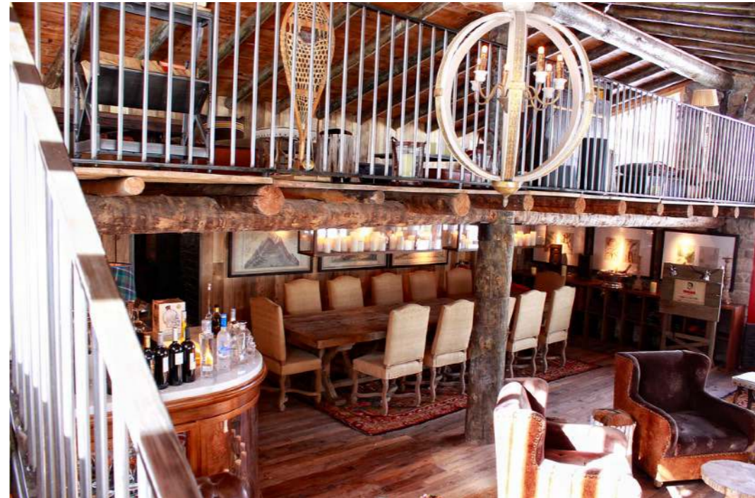
Interior Vodka Bar

The two mountain dinners with activity will be based on the number of person of the group as there is a minimum of people to reserve in some of them.